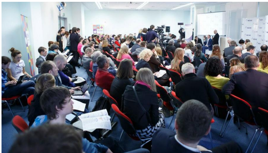
Ukrainian MPs report to public at the MLI-organized CHESNO Forum, 21 March 2013