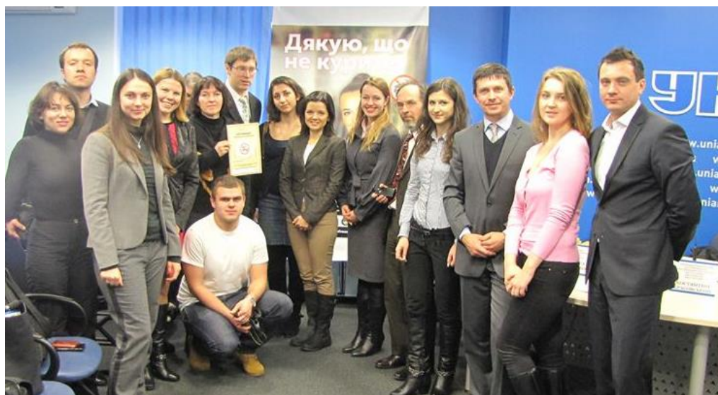
MLI team and volunteers presented results of the anti-smoking monitoring, December 2013

Hence, MLI team set liaisons with the state authority concerned, promoted due implementation of legislation that bans tobacco advertising, built up a network of volunteers sharing aims of this coalition, and contributed to the efficient operation of the NGOs' coalition Tobacco Free Ukraine .