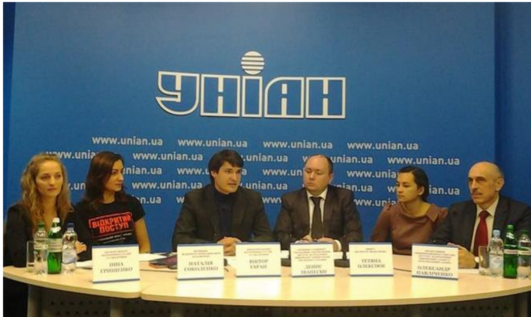
Experts telling about judicial protection of information rights at the MLI press-conference, 27.09.2013