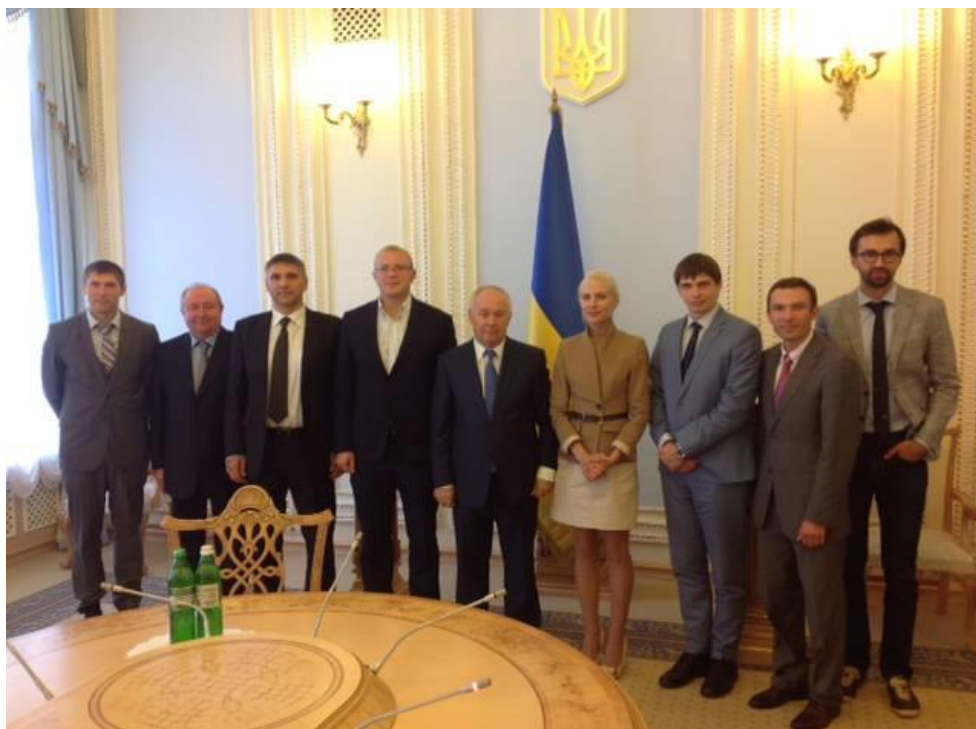
Taras Shevchenko and other members of the Open Civic Platform meeting with the Speaker of the Parliament, 2 September 2013

As noted by VRU Speaker , positive developments as to the personal voting was a merit of media and civic movements, so the Parliament should involve experts, journalists and representatives of NGOs into consideration of its agenda.