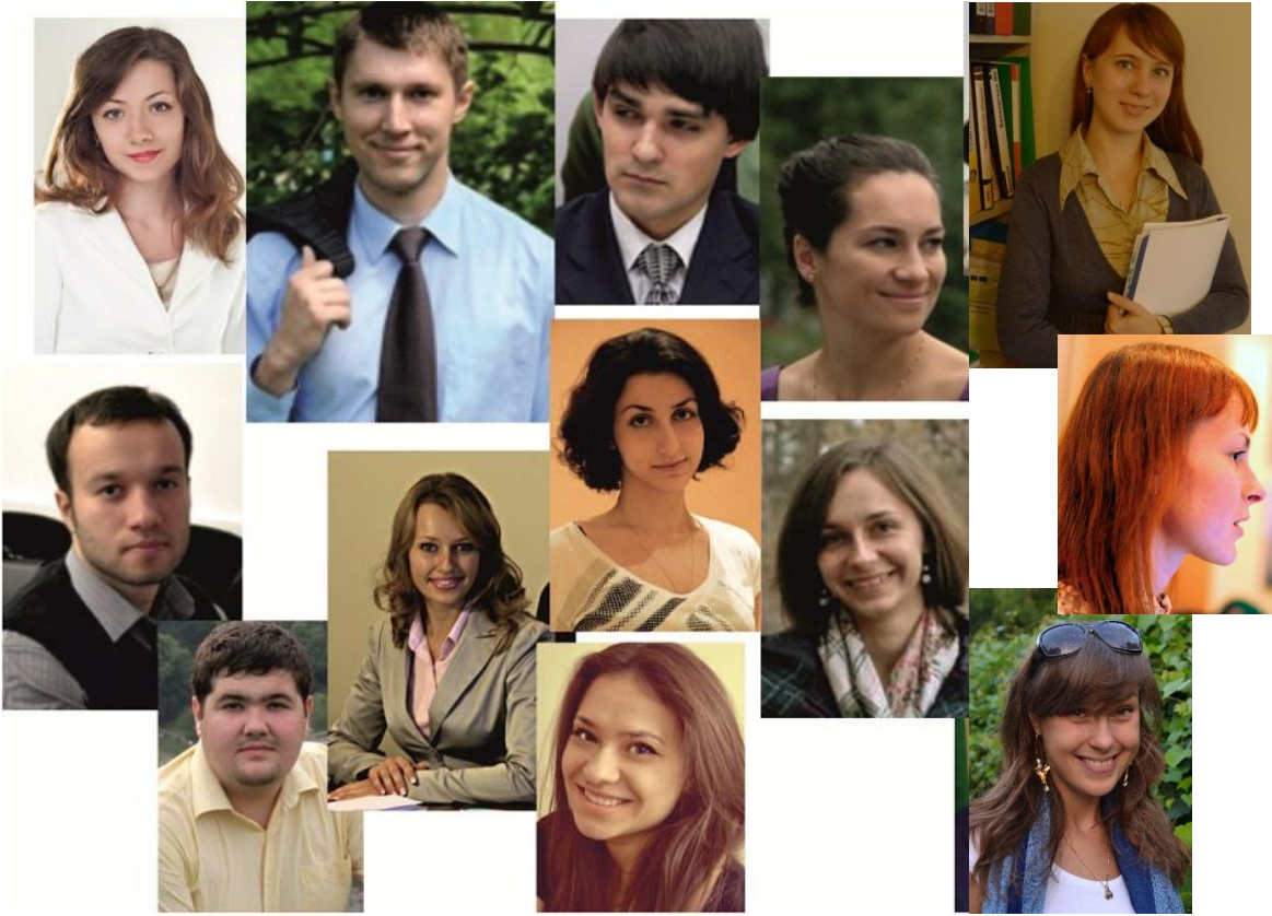
Media Law Institute team in 2013

The Media Law Institute team expresses its sincere gratitude to all partners and donor organizations that share our mission and provide necessary support in our activity.