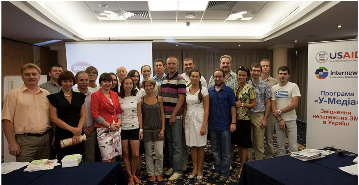
MLI Freedom of Information Defenders Forum, July 2013

Finally, MLI convened the first informal meeting of media lawyers and experts in Kyiv on October 30, 2013. About 20 media lawyers gathered to consider the impact of the EU-Ukraine Association Agreement signing on the Ukrainian media environment. Thereby MLI has launched regular communication and exchange of ideas between the media lawyers and experts while considering topical problems in the area and, in parallel, induced establishing of personal contacts.