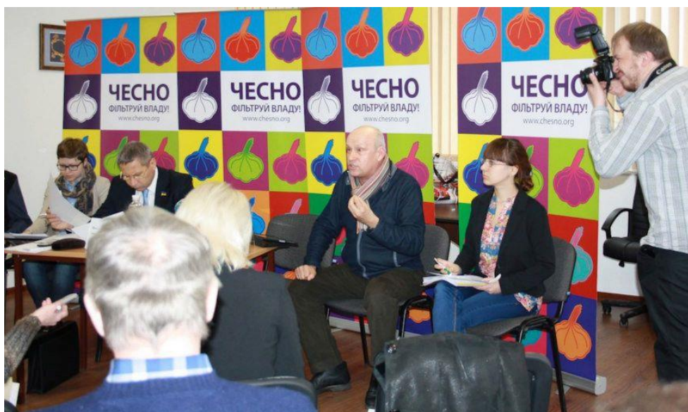
MLI lawyer spoke at the CHESNO presentation on local MPs' integrity in Donetsk, 27 March 2013

MLI equally ensured due communication of the Movement's legal aspects of activity and its Methodology of Integrity Assessment at its key public events, including CHESNO presentations in 4 major cities of Ukraine.